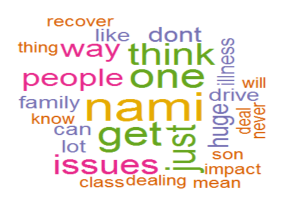
Figure 14. Themes word cloud

Finally, to create the word cloud, the command wordcloud(recoveryWords) can be used. The argument <colors> in this function can be used to change the colors of the wordcloud. Furthermore, the frequency of the words can be edited; for example, the arguments <min.freq> and <max.words> allow the user to determine a minimum and a maximum number for words to appear in the word cloud. Figure 14 shows the result of the word cloud.