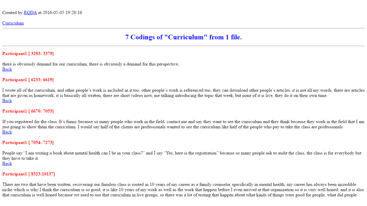
Figure 13. HTML export file.

Utilizing this window, the researcher can highlight the themes that he or she is interested in (or even all the codes) by holding the Control key and clicking on each code individually. The resulting HTML file can be seen in Figure 13 . In this example, the selected theme is "Curriculum" codes from the first participant.