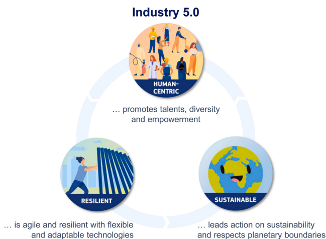
Fig. 2. Core values of Industry 5.0 [9].

Similar to Industry 4.0, Industry 5.0, aiming for success, will need substantial investment from government agencies. Regardless of the future of Industry 5.0, its core values – human-centricity, sustainability and resilience, have become major driving forces for societal progress instead of as a by-product of GDP-driven prosperity development. This is evident from recent government progress towards embedding them in national policies, such as Paris Agreement [33], Sustainable Development Goals (SDGs) [34] from the United Nations, Well-being of Future Generations Act [35], Genuine Progress Indicator 2.0 [36], The Economy of Well-being [37], National Performance Framework [38], and OECD Better Life Index [39].