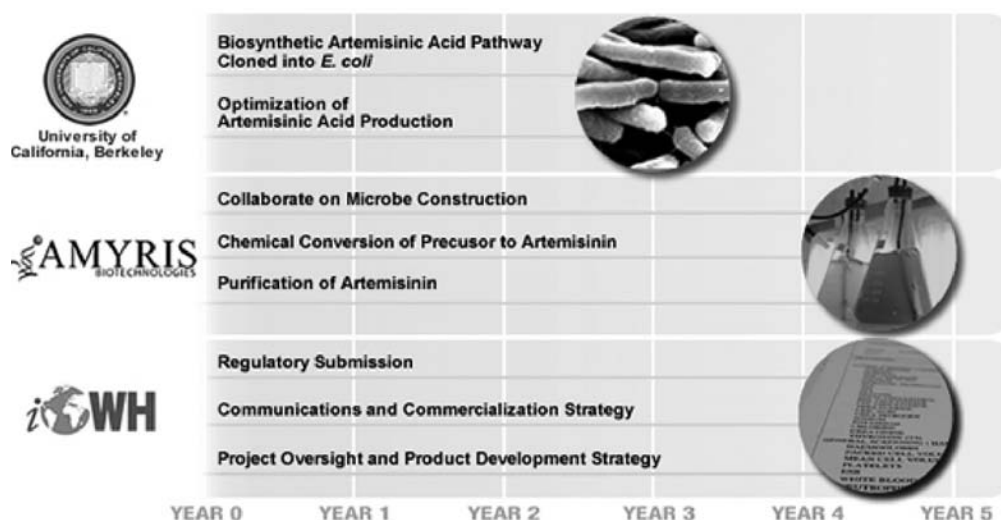
FIGURE 1: ACTIVITIES OF PROJECT PARTNERS (TO BE CARRIED OUT BY THE END OF THE GRANT PERIOD)

developed under the three-part collaboration agreement.